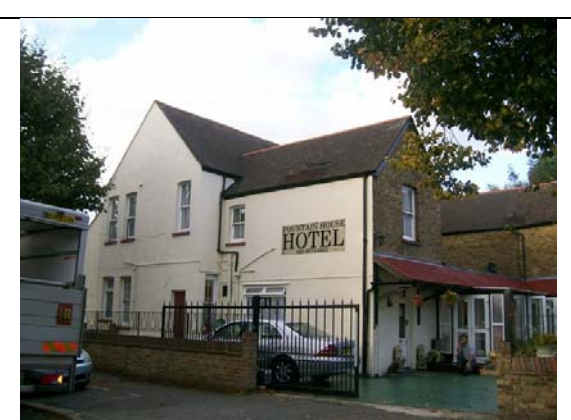
Elevation fronting Church Road