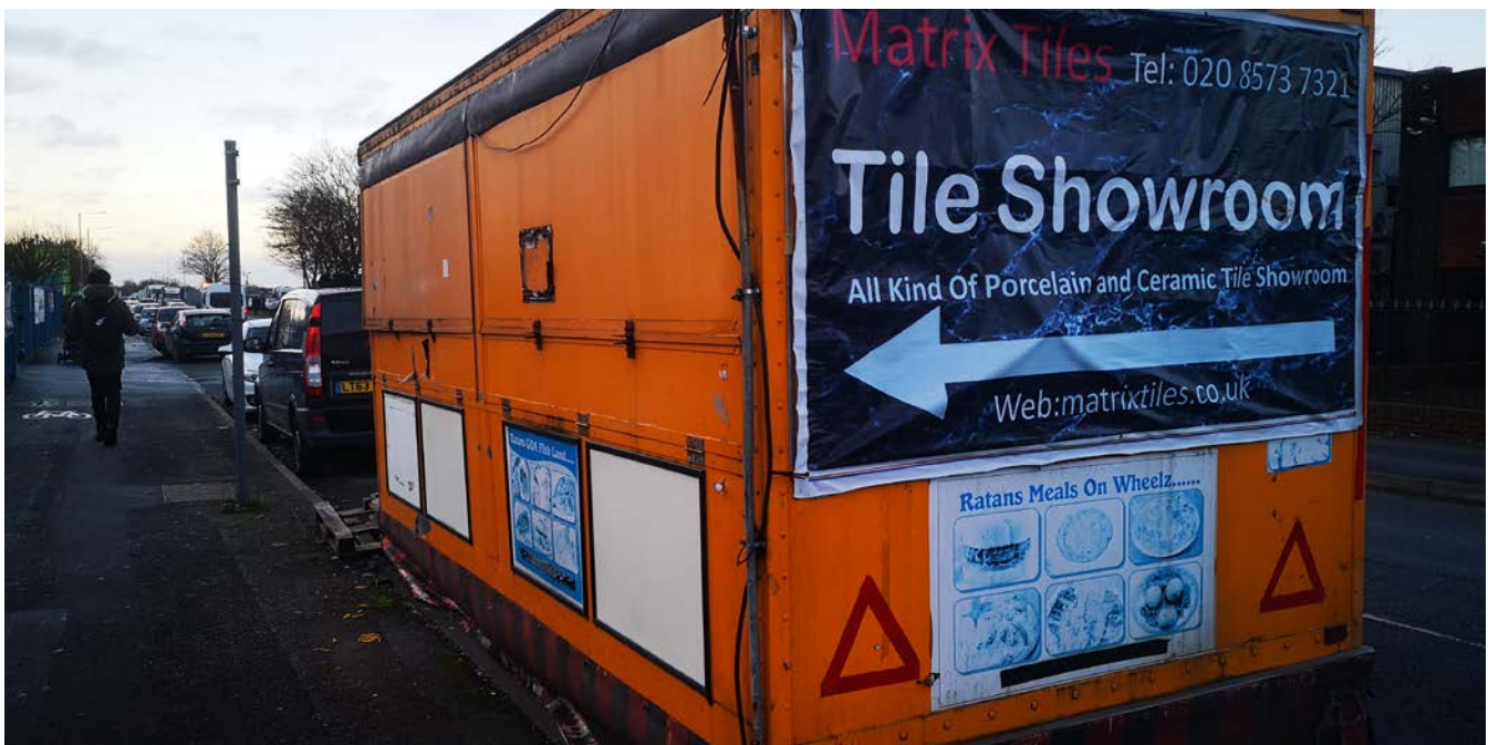
9 th December 2019