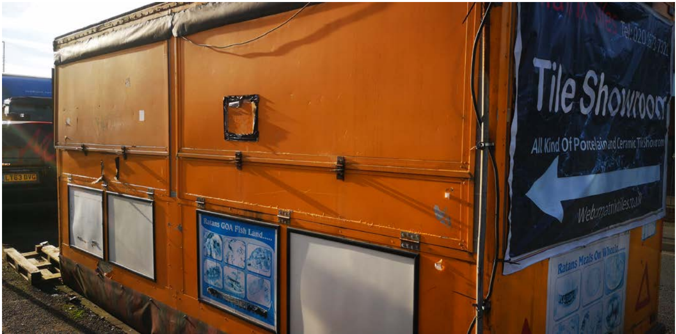
3 rd December 2019