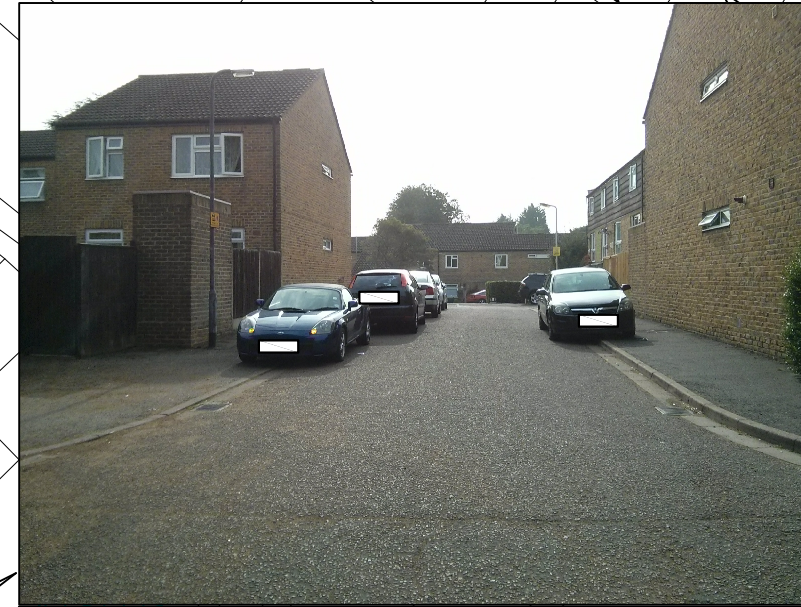
Only possible location suitable for footway parking on both sides of road