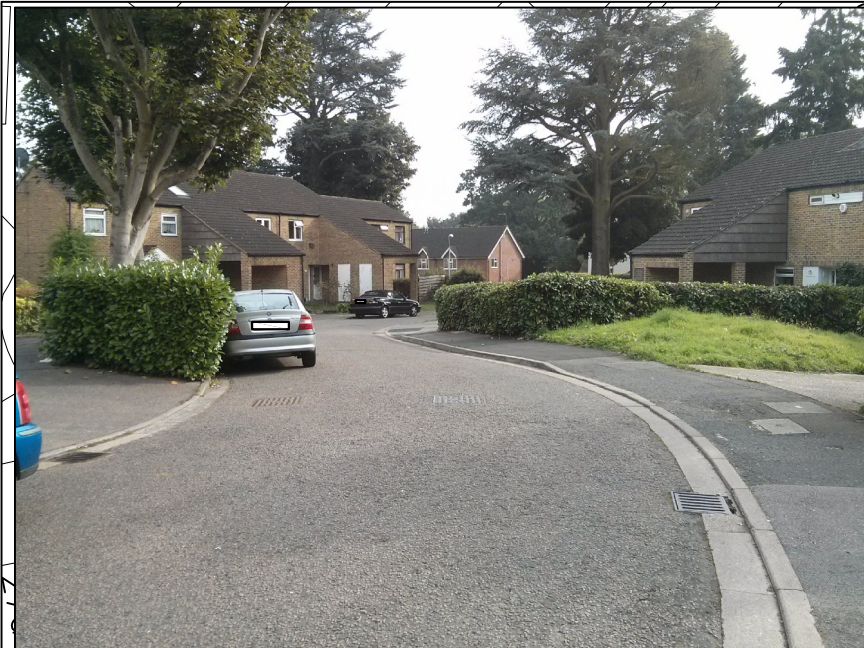
View southeast from outside No. 23