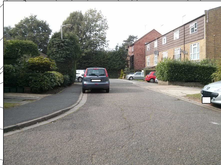
View towards the northwest corner of Closemead Close