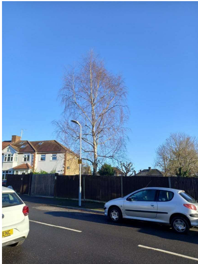
Photo 1: The subject Silver Birch in the rear garden of 32 Norwich Road, viewed from Cranbourne Road

TOWN AND COUNTRY PLANNING ACT 1990 (AS AMENDED), SECTIONS 198-201 AND 203