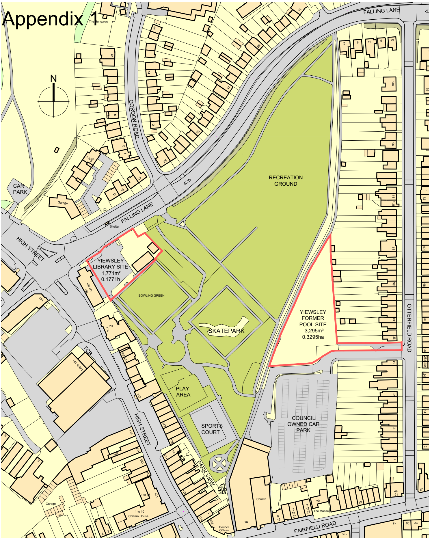
APPROPRIATION PLAN: scale 1:1250