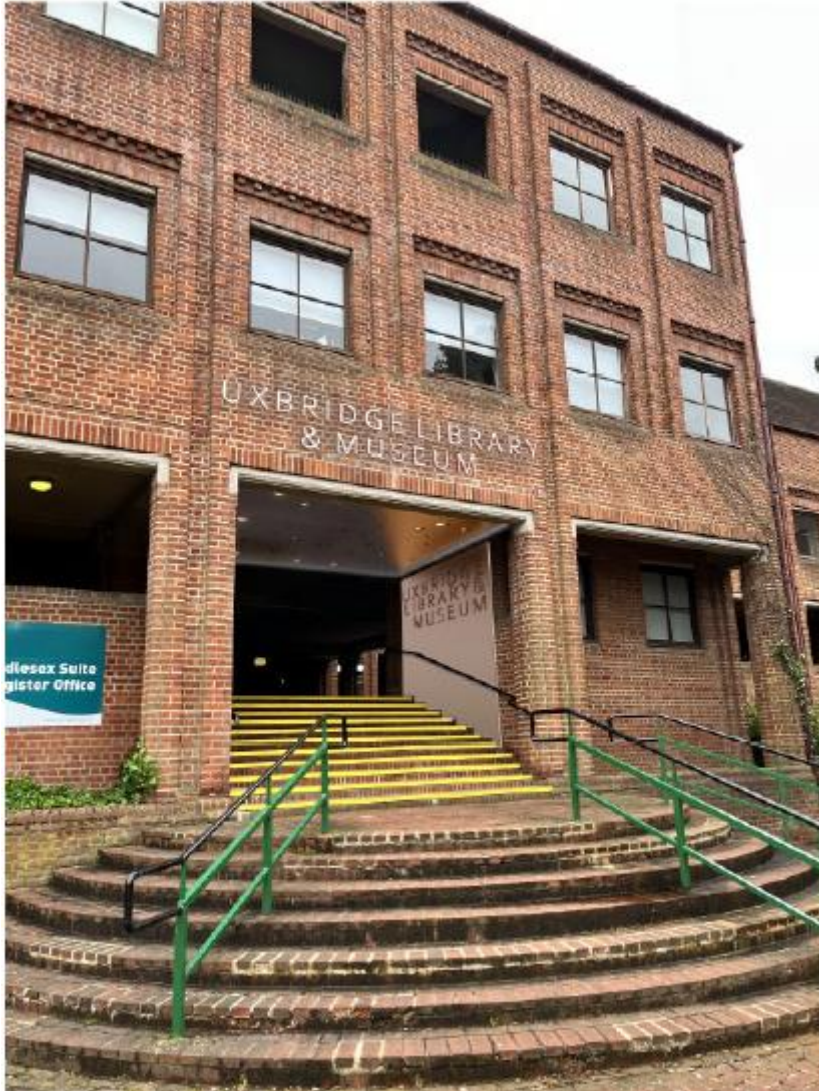
Figure 4: Proposed Signage at the Front Elevation of the Grade II Listed Building.

contextual design approach that recognises the prominence of the front elevation and detailing of the Grade II Listed Building, as these would be modest in size.