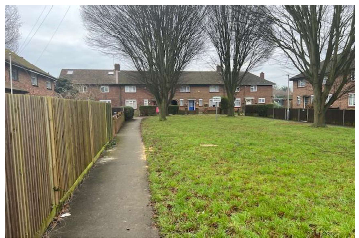
Figure 2: Street View Image of the Application Property (furthest terrace to the left)