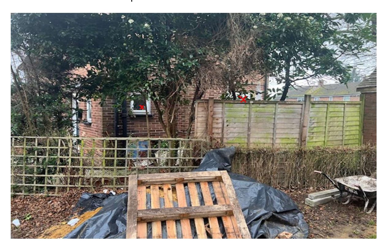
Figure 5: 11 Oak Avenue ground Floor side windows