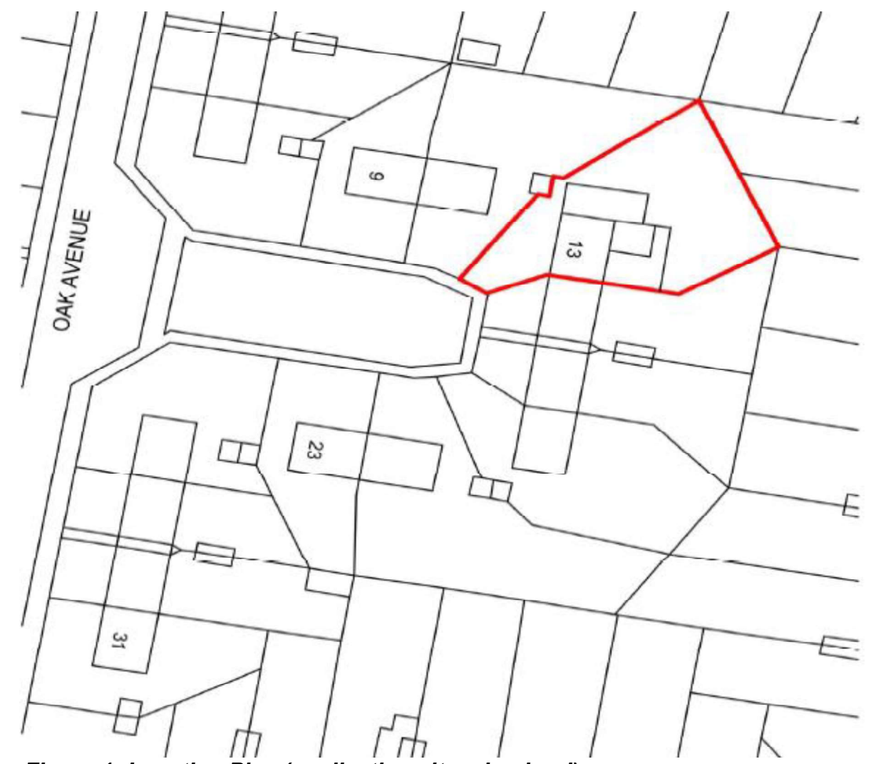
Figure 1: Location Plan (application site edged red)