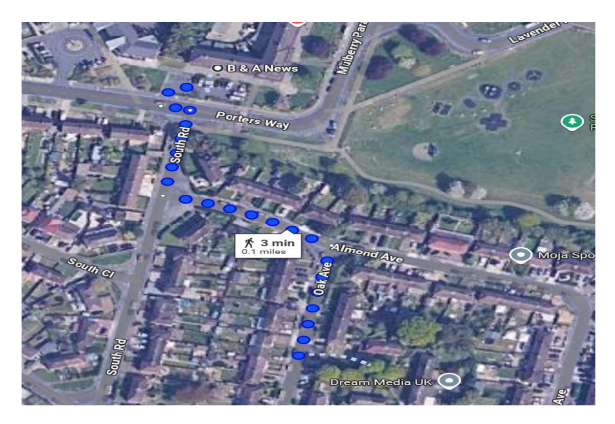
Figure 6: walking distance to shops and bus stops

8.48 Taking into consideration these points the development is considered to cause no harm to the local highways network. The parking required to serve the new development can be sufficiently absorbed on street and this arrangement is no different to the existing properties in this area of Oak Avenue.