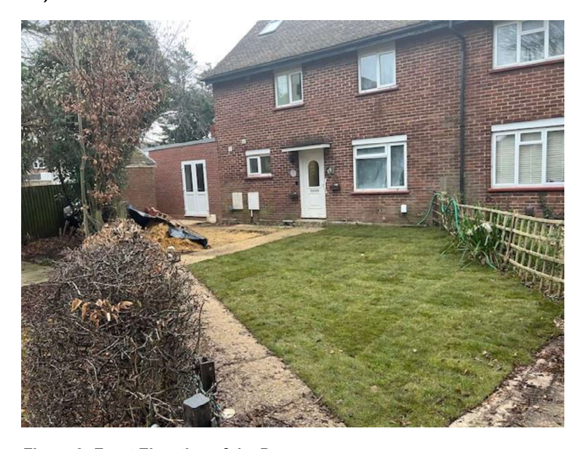
Figure 3: Front Elevation of the Property

Hillingdon Planning Committee – 12 March 2025